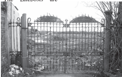
Portadown Gasworks Gates derelict at start of site work for the ASDA Store Feb 2012.

Edenderry Cultural and Historical Society extends its sincere thanks to everyone involved in 'The Portadown Gasworks Gates Project' and we feel sure the result is greatly appreciated by the Edenderry community.